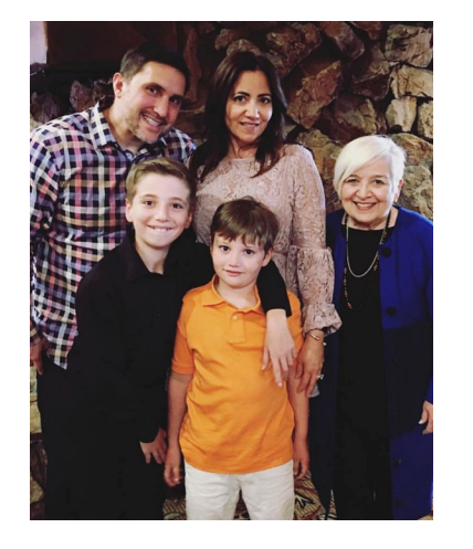
Judge Katherine Peters

recommendations to meet the needs of the defendant and public safety.